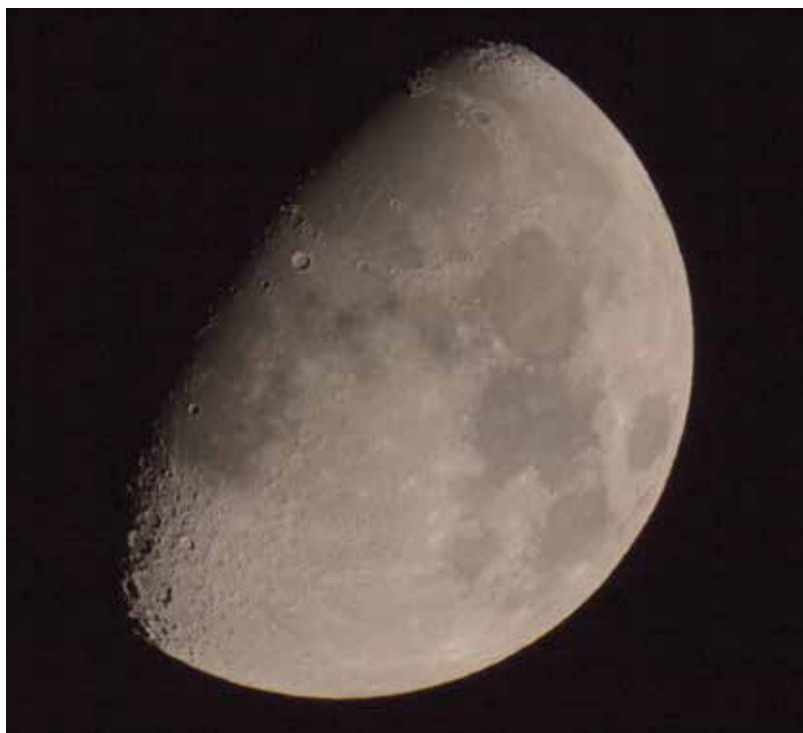
▲ The Moon taken with a Canon EOS 50D DSLR, single image 1/100th of a second at ISO 100

This is a fun system to use. Although there is an option to connect a SynScan hand controller, to get the most of this setup its worth downloading the SynScan app for your smartphone. The SkyMax-127 feels like the future of telescope control, certainly for anyone that likes technology and is just beginning their exploration of the sky. S