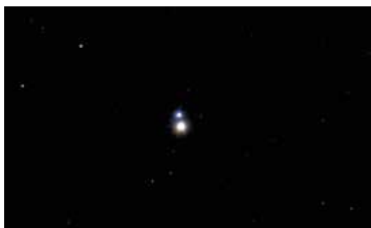
◀ Albireo, Canon EOS 50D DSLR, five-second exposure at ISO 3200, slight processing with PaintShop Pro X9